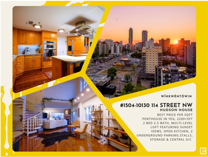
#1504 10130 114 STREET HUDSON HOUSE OLIVER, EDMONTON